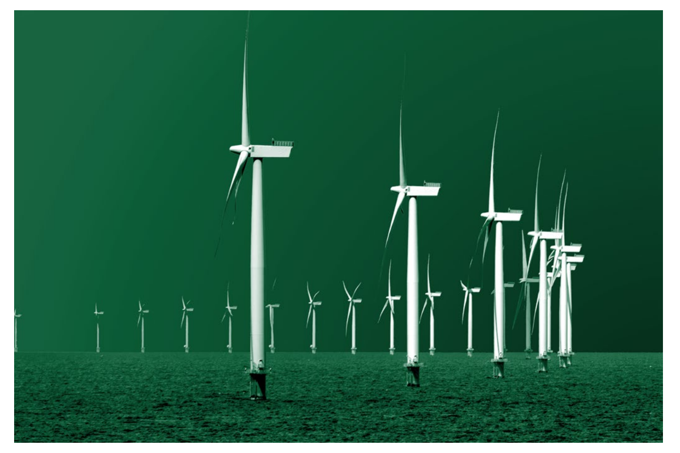
Photograph of an offshore wind farm in the Kattegat sea outside Denmark